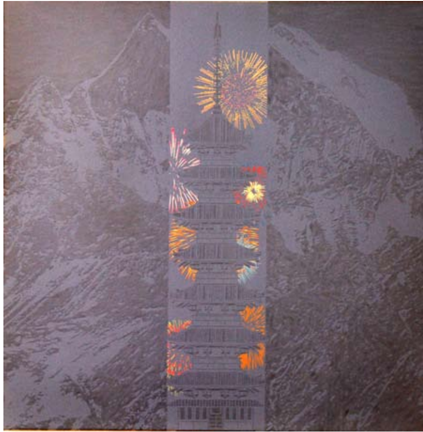
Natsu, oil on canvas, 24 x 24 inches