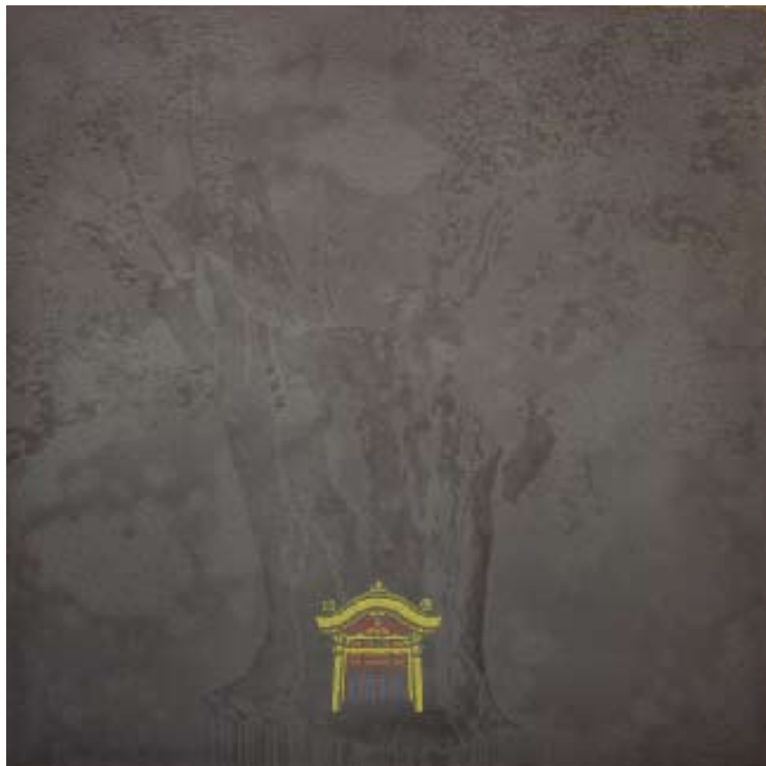
MOMO, oil on canvas, 24 x 24 inches