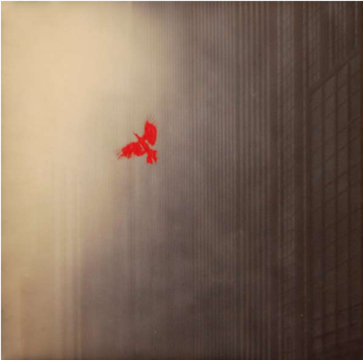
Redbird, oil on canvas, 16 x 16 inches

Through numerous build-ups of thin layers of oil paint, Oyatani's work combines elements of abstraction and representation, pattern and grid, and surface and illusion. Upon further inspection, several layers or 'planes' begin to emerge, creating an almost hyper real space where the 2nd, 3rd and 4th dimensions collapse into altogether entirely different realities