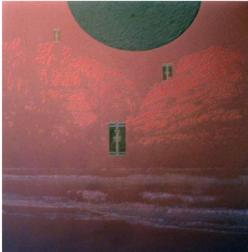
Door at the Gate, oil on canvas, 24 x 24 inches