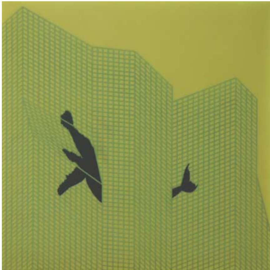
Humpback, oil on canvas, 16 x 16 inches