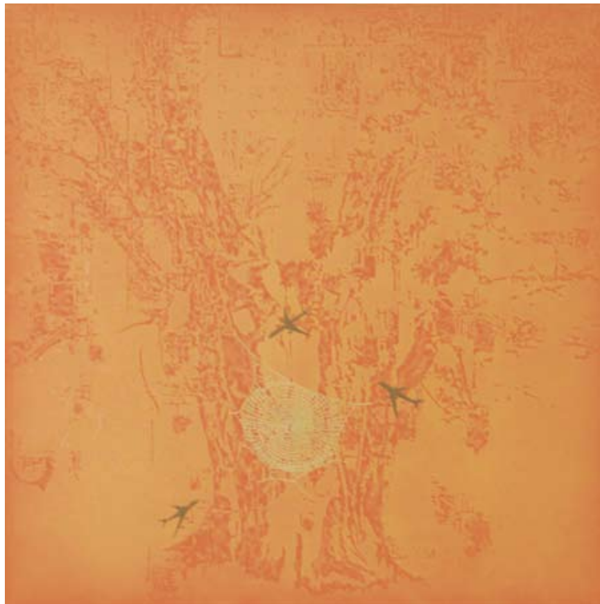
3 Planes, oil on canvas, 24 x 24 inches